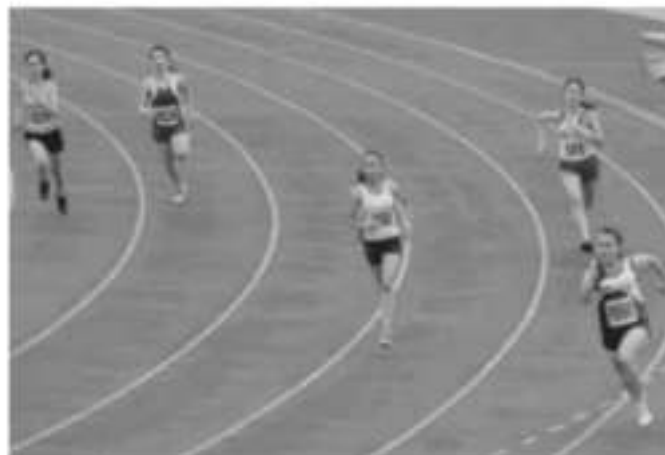
(Chemistry, grade 7, Intuitext, pag. 57)

Figure 2. Visual expression of the 'electron shells as track field lanes' metaphor in a chemistry textbook