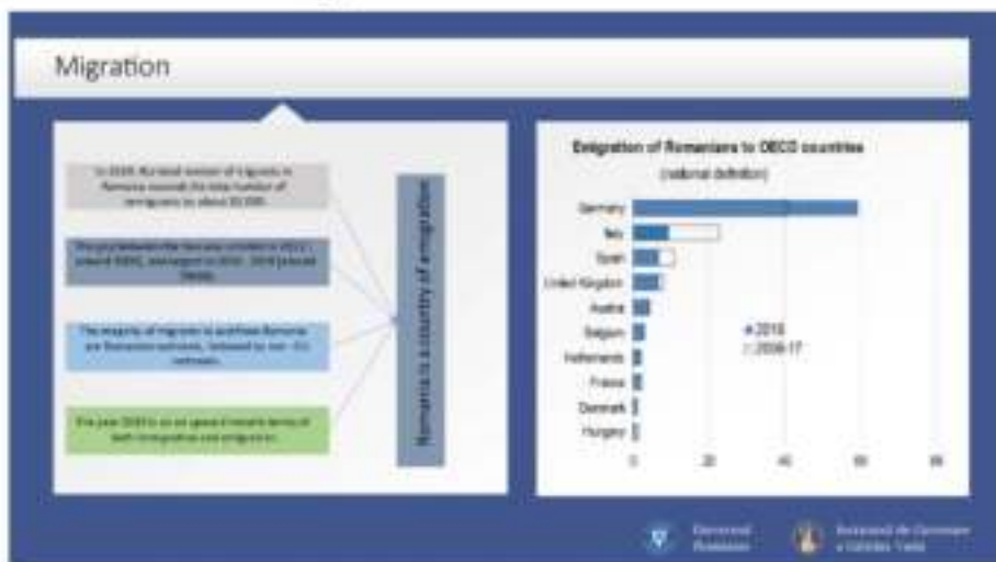
Figure 3: Infographic on the phenomenon of Romanian migration between 2010 and 2019

Source: Social Atlas: Romania 14 years after joining the European Union (2021). Infographic report was developed by the Institute for Quality of Life Research with the support of the Romanian Government