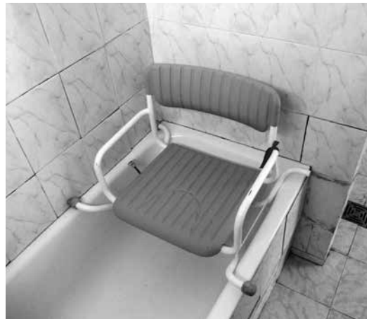
Fig. 5. The bathing chair