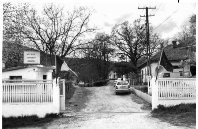
Fig. 1. The access road for the Tichilești hospital