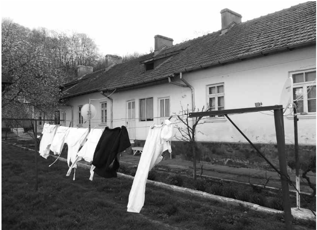
Fig. 3. Pavilions accommodating individuals

medical staff, bathrooms and toilets, the kitchen and a club where people gather to watch TV, play games, or read books from a small library. The whole area is surrounded by wooden hills where, at different heights, some small two-room houses surrounded by gardens are located; they accommodate families created between institutionalized individuals. 2 On one of these hills, there is also a cemetery for the inhabitants of the leprosarium.