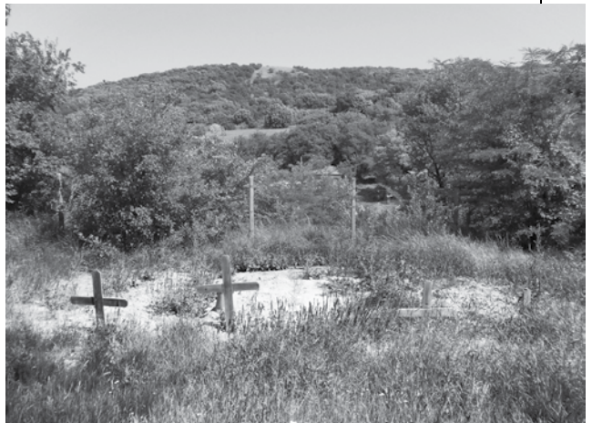
Fig. 4. The cemetery

These imprints of a medically cured disease are responsible for isolating the inhabitants of the leprosarium even after the 70s, when the MDT treatment became available in Romania. Hence, it is an isolation based on a socially constructed image of the disease that is legitimized by medical knowledge, filtered through the individuals' personal subjectivity and that