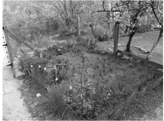
Fig. 2. The garden of a family house

On the opposite side of these pavilions, over an area looking like a plaza, one notices medical offices and other social spaces. They include the offices of the