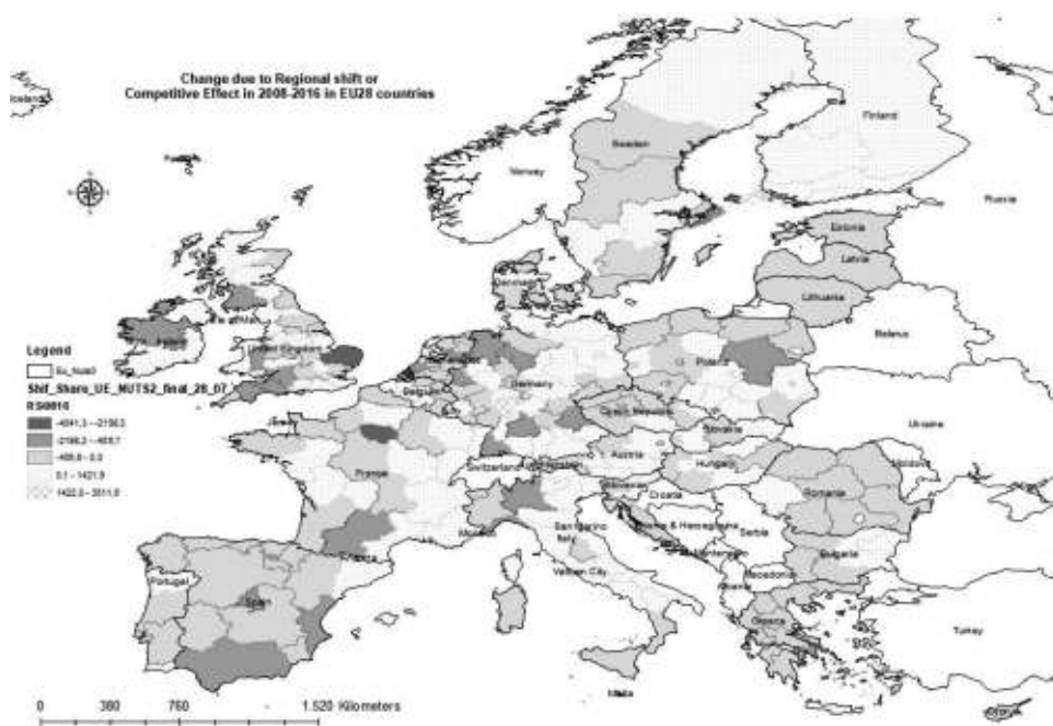
Figure 3. Employment change in N79 due to Regional shift or Competitive Effect in EU28 during 2008–2016 period at NUTS 2 level.