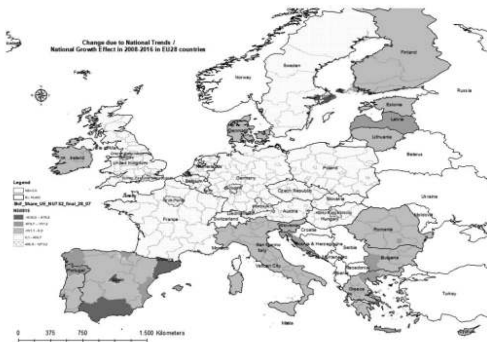
Figure 1. Employment change in N79 due to National Trends; National Growth Effect in EU28 during 2008–2016 period at NUTS 2 level.